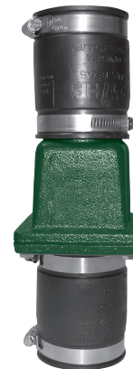
30-0151 Cast Iron