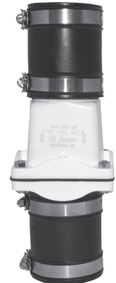
30-0021 Pvc Plastic

Consult Factory or local representative for state approvals