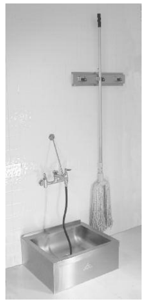
9-OP-20 shown with optional faucet, hose & hanger