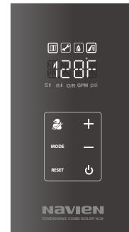
INCLUDED Illuminated Front Panel with Advanced Hydronic and DHW Operation