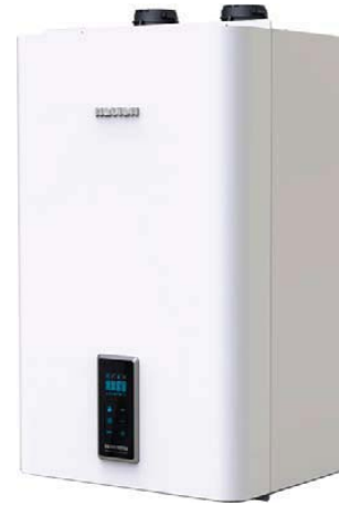
Sleek Design - Compatible with 2" PVC Vent