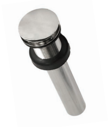
DR130-BN Brushed Nickel DR130-CH Chrome DR130-ORB Oil Rubbed Bronze DR130-PN Polished Nickel DR130-WC Weathered Copper