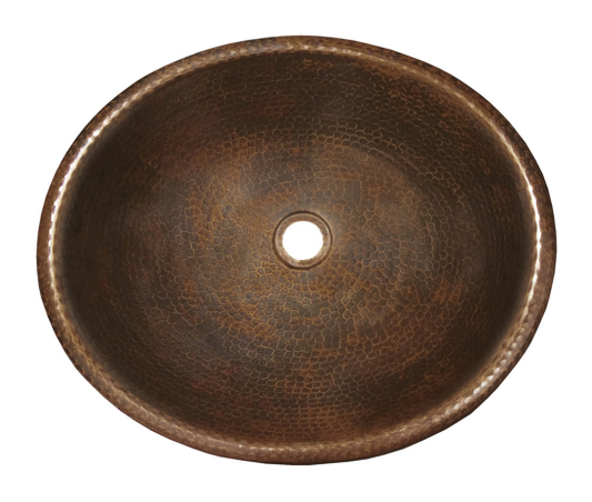
CPS240- Antique CPS540- Brushed Nickel