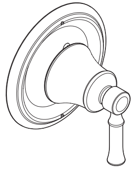
Dartmoor™ Two/Three-Function Transfer Valve Trim Kit