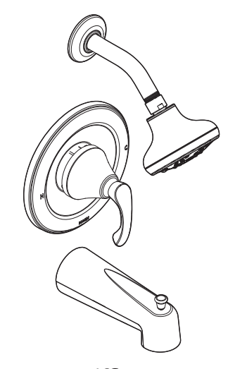
Tiffin™ Posi-Temp® Single-Handle Tub/Shower

Visit www.moen.com/support for complete details and limitations