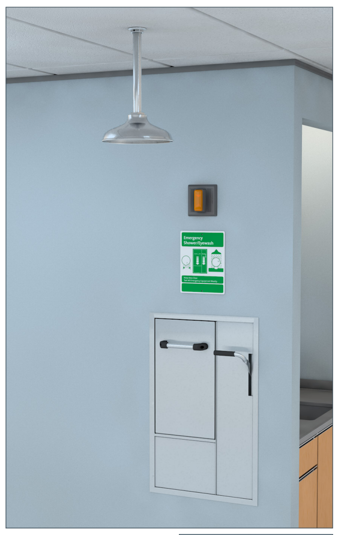
Note: Shown with optional AP280-235 electric light and alarm horn unit (sold separately).