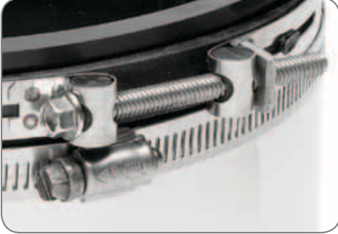
316 S.S. Nut and Bolt Clamps

The Ultimate Nut & Bolt RC - Engineered for resistance to heavy earth loads and shear forces, while providing improved pipe alignment.