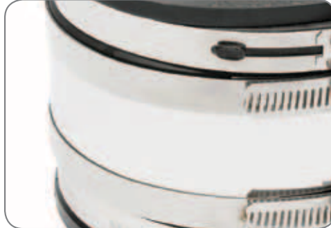
.012" (12mil) Stainless Steel Shield