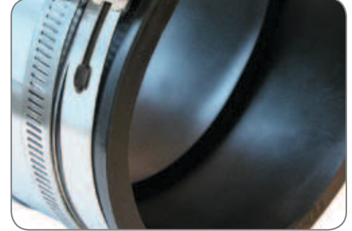
One Piece Molded-in Bushing Gaskets