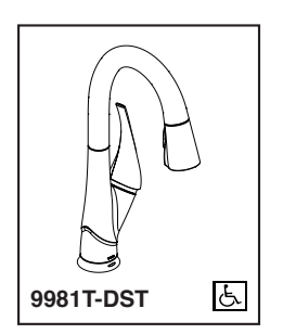
Submitted Model No.: Specific Features: