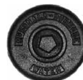
5623 Tapped 1 1/2"