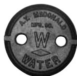
5601 Tapped 1" Erie Pattern