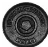
5614 Tapped 1 1/4"