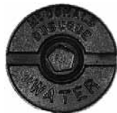
5607 Tapped 1"