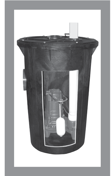
Products may not be exactly as pictured.