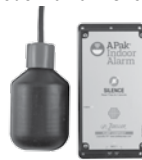
Model 10-4012 shown.

OPTIONS: Zoeller recommends a High Water Alarm for added protection. See FM0732 for available models