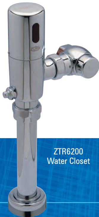
ZTR6200 Water Closet