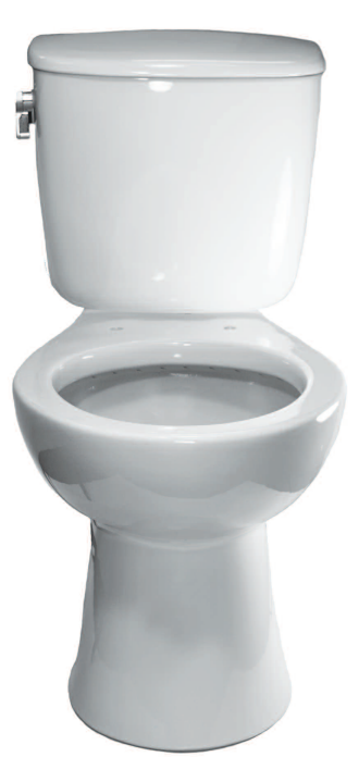
Left Handle Model Shown