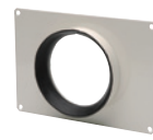
MAR Rectangular Duct Adapter