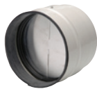
MCA Backdraft Shutter