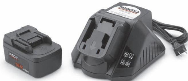
18V Li-Ion Battery and Charger