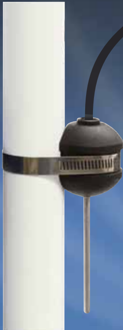
Ultimate Sensor with Ultimate Controller (USC3)