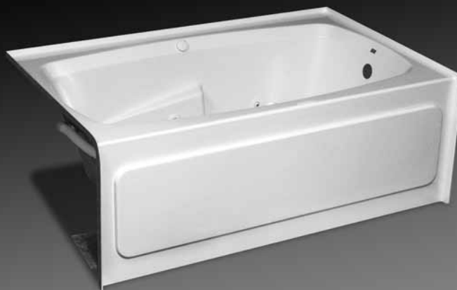
"S" Model w/ Full Apron & Removable Access Panel