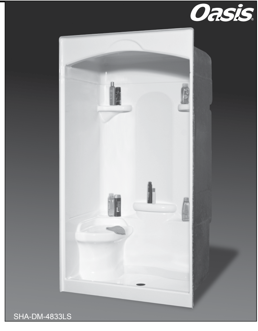
SHA-DM-4833 SHA-DM-4833RS (right seat) SHA-DM-4833LS (left seat)