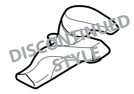
CHATEAU<sup>®</sup> Single-Handle Lavatory Faucet

with Metal Waste Assembly Models: L4621 series