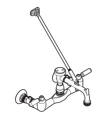
Two-Handle Service Sink Faucet

Warranted for 5 years against material or manufacturing defects