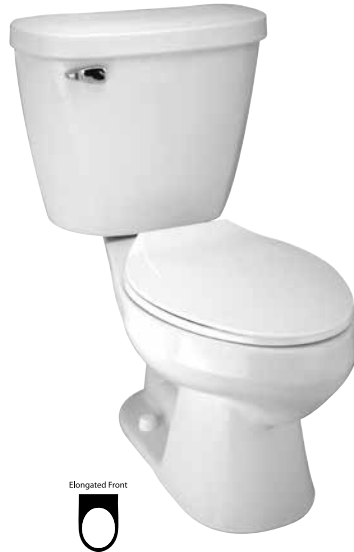
Model 382-386 Toilet seat not included