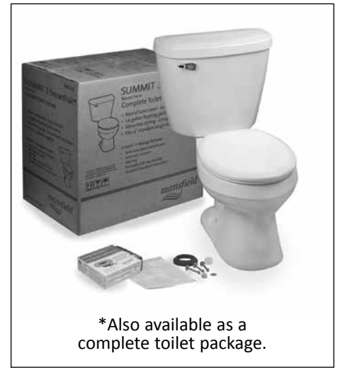
*Also available as a complete toilet package.