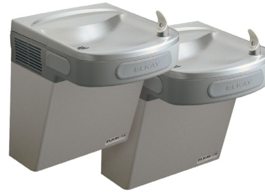
*Versatile cooler configuration as shipped