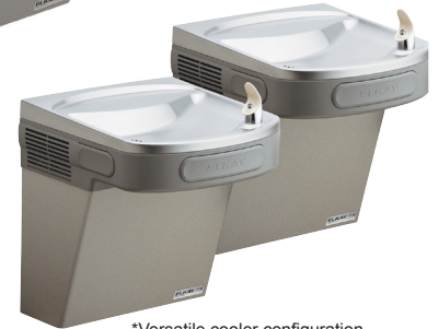
*Versatile cooler configuration alternate installation