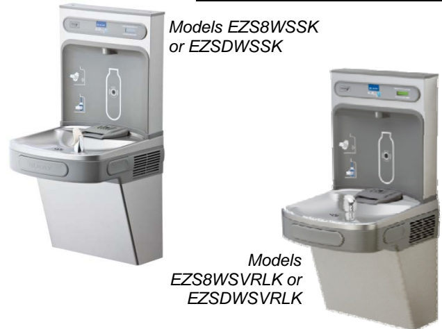
Models EZS8WSSK or EZSDWSSK

**Based on 80° F inlet water & 90° F ambient air temp for 50° F chilled drinking water.