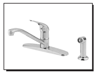
D403612 (shown) D403512 (w/o spray) MELROSE<sup>TM</sup>

Danze faucets are covered by a manufacturer's limited "lifetime" warranty for manufacturing defects.