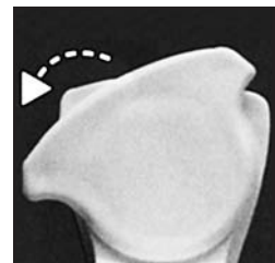
TWIST HINGE TO UNLOCK