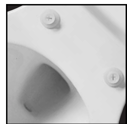
EASY•CLEAN™ LIFTS OFF FOR EASY CLEANING