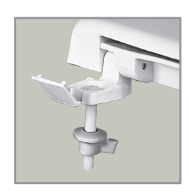
NON-CORROSIVE BOLTS AND WING NUTS