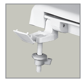
NON-CORROSIVE BOLTS AND WING NUTS (290TL)