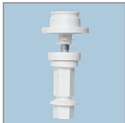
STA-TITE® RESIDENTIAL FASTENING SYSTEM™