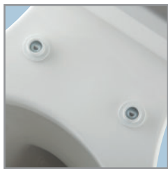
EASY REMOVAL OF SEAT FOR THOROUGH CLEANING