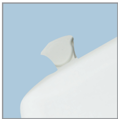
PLASTIC WHISPER•CLOSE® WITH EASY•CLEAN & CHANGE™ HINGES