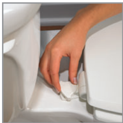
TWIST HINGES TO UNLOCK