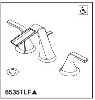
Submitted Model No.: