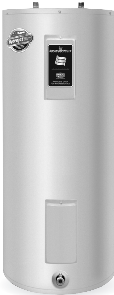
Photo is of RE250S