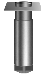
Adjustable air intake tube

NEW LOW CONSUMPTION PILOT USES LESS B.T.U.'S