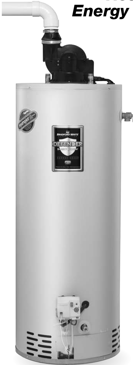
Photo is of M-1-TW-40S6FBN