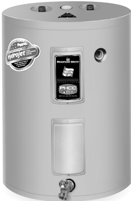
Photo is of LD-20L3-3