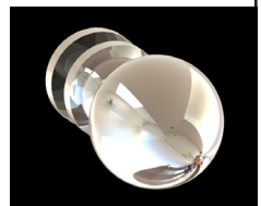
Optional Back-to-Back Vonse Knob