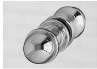
Optional Back-to-Back Tresor Knob