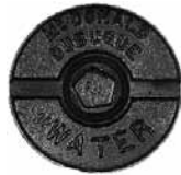
5607 Tapped 1"