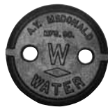
5601 Tapped 1" Erie Pattern