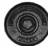
5623 Tapped 1 1/2"