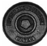
5614 Tapped 1 1/4"