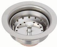
Sink Strainer Optional