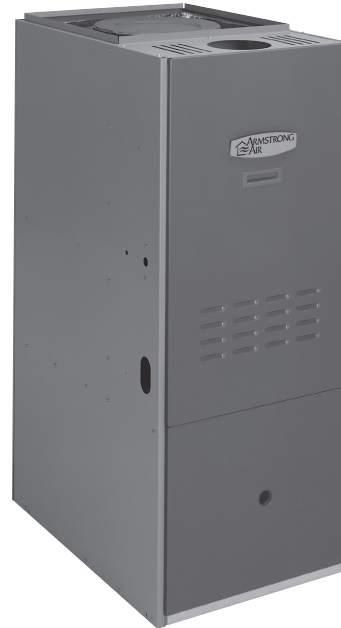
L83UF = Upflow / Highboy