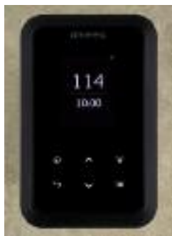
T100 Touch Control