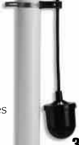
U.S. Patent No. 5,728,987