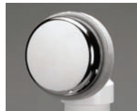
Snap-on overflow plate. No screws