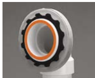
Easily remove membrane after test