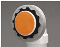
Includes built-in test membrane