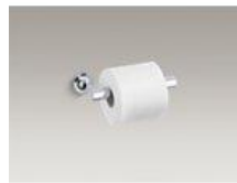
Pivoting toilet tissue holder K-14377-CP